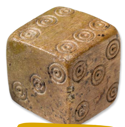
A die found at Birdoswald Roman Fort made from bone and handcarved with circular patterns numbering from 1 to 6.

Q Why do you think these objects survived for so many hundreds of years? What type of objects may not have survived?